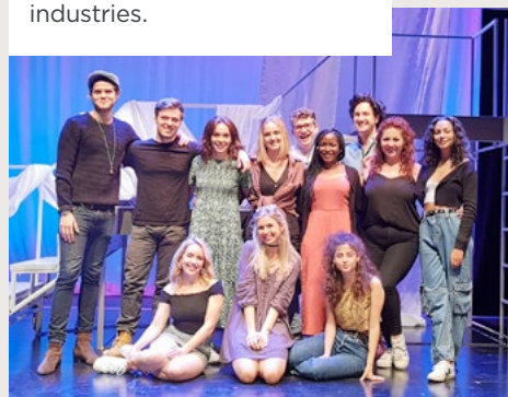
New York Showcase Students.

Following on from our New York Gala for Catherine Zeta-Jones on St David's Day, the College was back in the heart of America's theatreland for its annual US Showcase at the Signature Theatre on 42nd Street. Now in its fourth year, the Showcase acts as a springboard into the industry, giving our American and Canadian acting and musical theatre graduates an opportunity to perform in front of agents, managers, casting directors and industry guests from the American entertainment industries.