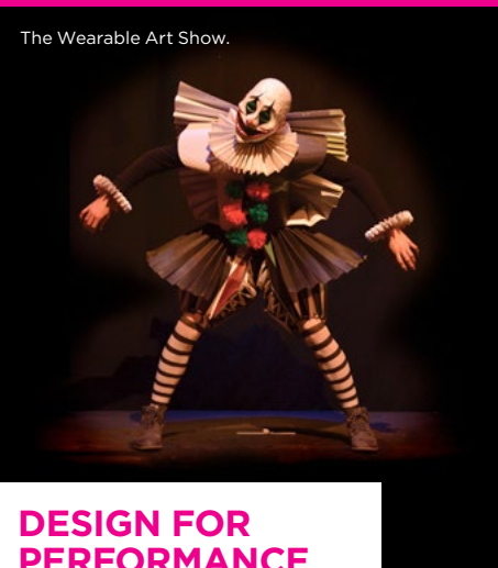
The Wearable Art Show.

Youth and rebellion erupt on to the stage at the Sherman Theatre in March as our musical theatre performers star in the rock musical based on Wedekind's controversial play Spring Awakening .