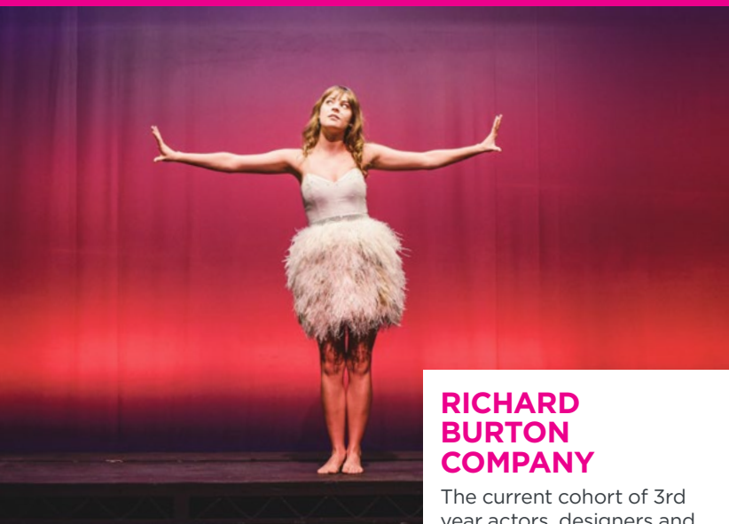
Richard Burton Company, Stupid F**king Bird