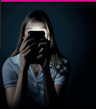
Music Theatre Wales: Denis + Katya

Our singers bring Mozart's enduring comedy Così fan tutte to life in the Dora Stoutzker Hall and Music Theatre Wales visit the College for the first time with Denis + Katya , exploring our age of digital connection in association with London Sinfonietta.