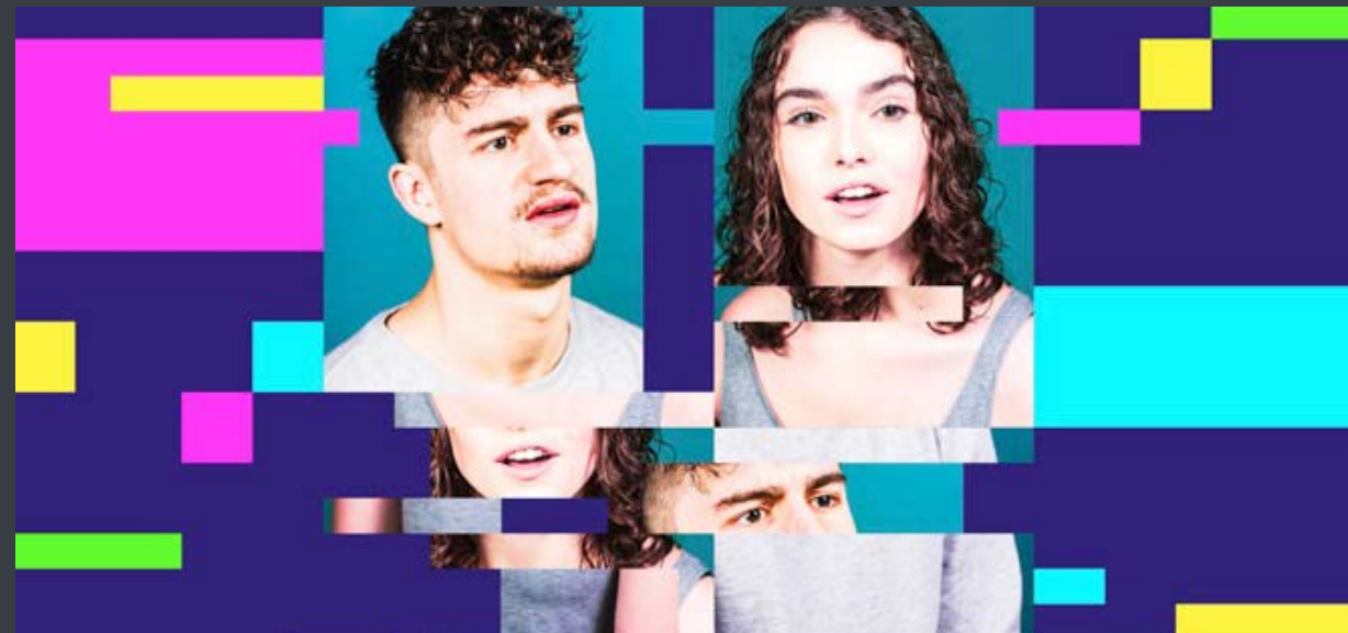
Ripples, National Theatre Wales + Sherman Theatre Network Play Readings initiative, in collaboration with BBC Cymru Wales and BBC Arts

DESPITE OUR VENUES BEING CLOSED, THE CREATIVE PROGRAMME AT THE ROYAL WELSH COLLEGE HAS CONTINUED TO FLOW IN DIFFICULT CIRCUMSTANCES.